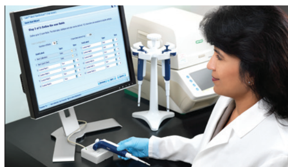
Optional RFID Reader works with all Rainin RFID-enabled pipettes, and interfaces with METTLER TOLEDO's LabX™ Direct Pipette-Scan™ calibration check.