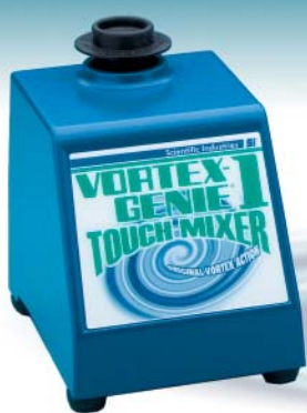
HIGH SPEED MIXER